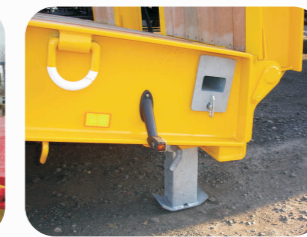
Retractable Rear Steady Legs