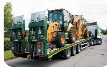
The slope plant carrier provides operators with the versatility of a full flat deck.