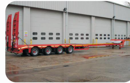
The four axle centre spine extendable machinery carrier with rear steer axle(s).