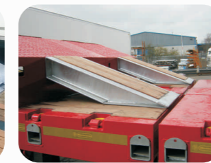
Neck Clip-On Ramps