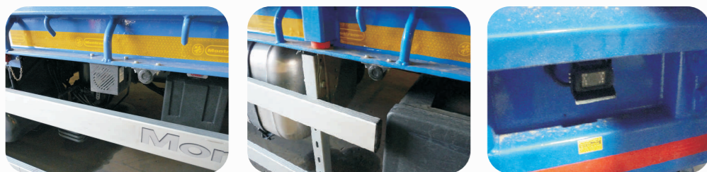
Back Chat and Sensor

Gripped walkways allow the driver to maintain safe access along the deck even when the load takes up the full width of the trailer bed.