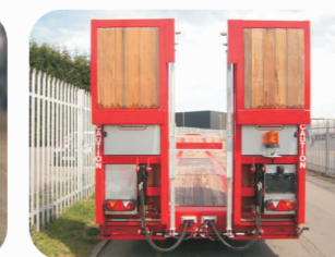
Double Flip Side Shift Ramps