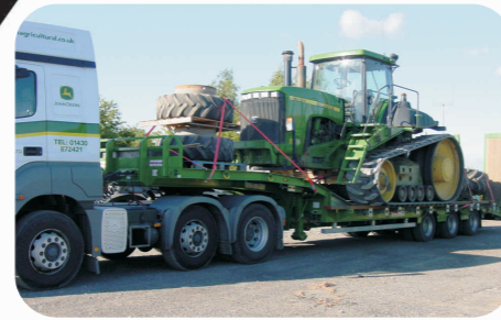
Operational flexibility, the key to Montracon's tri axle machinery carriers success. High spec as standard with numerous options help boost flexibility still further.

This trailer has been designed to offer the ideal trailer to customers wanting to transport machinery from one place to another. The hauling capacity of the Montracon machinery carrier meets both CAT1 and in part CAT2 legislation, making for a really practical solution to heavy plant and machinery transport.