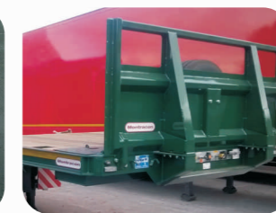
Various headboard configurations available including ENXL Rating