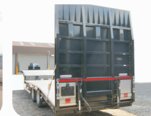
Full Width Ramps