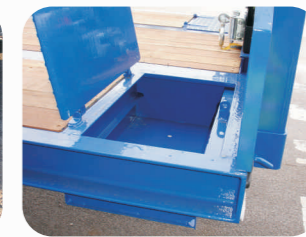
Deck Mounted Tool Box