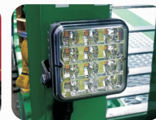
Strobe LED Lighting Options