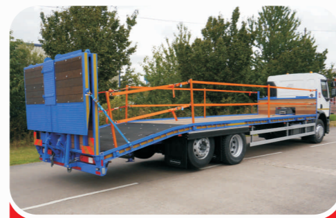
26 tonne Renault

In addition to it's extensive range of machinery carrier trailers, Montracon also produces a range of rigid bodies from 7.5 tonnes gross weight upto 32 tonnes