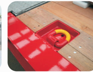
Hinged Lashings Rings