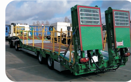
Tandem axle step-frame machinery carriers can be more manoeuvrable than rigid beavertail trucks when it comes to small local plant deliveries.