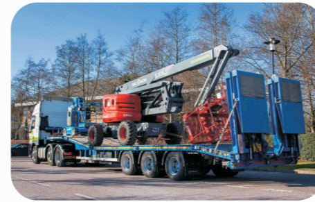
Access specification is ideally suited for loads with a low ground clearance.