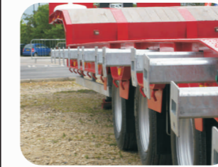
Outriggers extending deck by max 600mm

As one would expect from a company with over 30 years experience in trailer manufacture, Montracon machinery carriers are offered with a wide range of options designed to match an equally wide range of operating requirements.