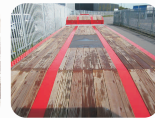
Hardwood Timber Floor