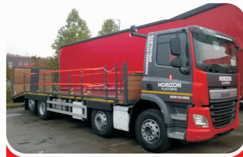
32 Tonne DAF